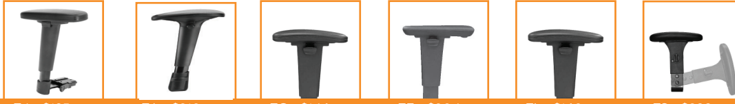
T4 - $195

T-style, angled, with urethane pad. 4-way adjustable.