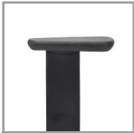
TH - $250

T-style, super duty arm, gel comfort pad