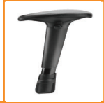
TA - $210

T-style, angled, with urethane pad. 4-way adjustable.