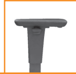
TE - $304

T-style with urethane pad. Height adjustable.