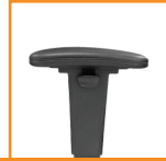
TC - $146

T-style, angled, with urethane pad. Height & Width Adjustable