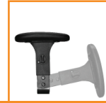
TS - $299

T-style with urethane pad. For lower arm heights. Height adjustable.