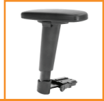
T4 - $195

T-style, angled, with urethane pad. 4-way adjustable.